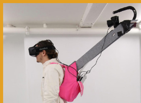
Immersive Technologies (such as VR/ AR/ XR, games, audio)