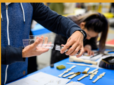
Sustainable Product Design