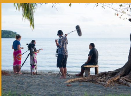
Indigenous Film or Documentary

Our areas of interest include, but are not limited to; indigenous film or documentary, sustainable product design, immersive technologies, interface and interaction, innovation in sound and music, and events and curatorial.