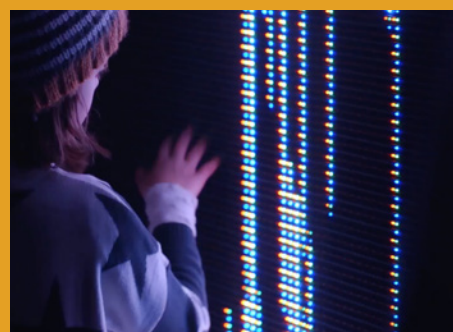
Events and Curatorial (such as exhibitions, festivals, experience, performance)

College of Creative Arts Toi Rauwhārangī Massey University Wellington creative.massey.ac.nz/mce