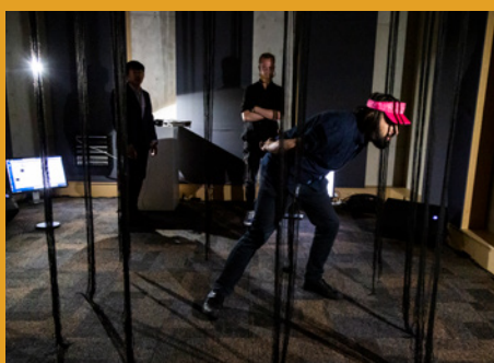
Interface and Interaction (such as installation, games, electronics and software innovation)